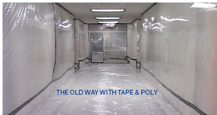
THE OLD WAY WITH TAPE & POLY